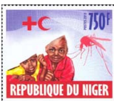
Children under mosquito net

Design Size: 42 x 36 Margins: clear Sub-topics: mosquito Notes: singles from compound sheet Price: C