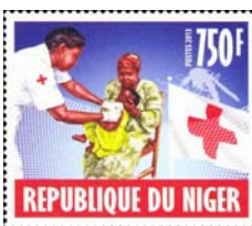
Nurse treating child held by mother