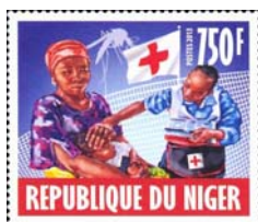
Mother, child and Red Cross worker