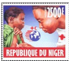
Nurse inoculating child

Design Size: 42 x 36 mm Margins: clear Sub-topics: _____ Notes: from souvenir sheet Price: C