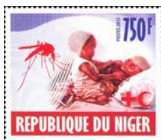
Mother and child under mosquito net

Design Size: 42 x 36 Margins: clear Sub-topics: mosquito Notes: singles from compound sheet Price: C