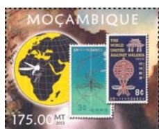
stamps of 1962 and globe

Size: 39 x 48 mm Notes: as (2013) 2: single from souvenir sheet Price: C