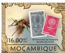
stamps of 1962 and mosquito