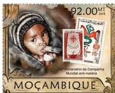
stamps of 1962 and patient