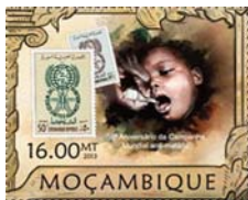
stamps of 1962 and patient