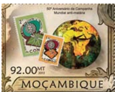
stamps of 1962 and globe

Size: 47 x 37½ mm Notes: as (2012) 2: singles from collective sheet Price: C