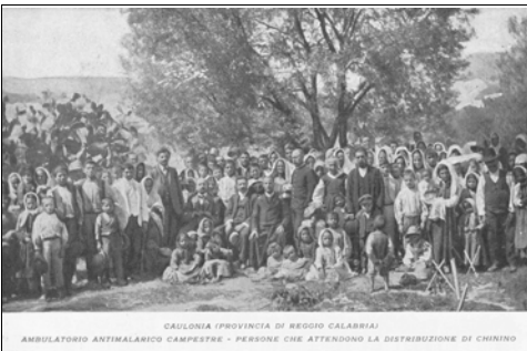
CAULONIA (PROVINCIA DI REGGIO CALABRIA) AMBULATORIO ANTIMALARICO CARPESTRE - PERSONE CHE ATTENDONO LA DISTRIBUZIONE DI CHININO

Image: people seeking quinine pills Text: Outpatient clinic in antimalarial country - People who are waiting for the distribution of quinine Notes: Price: E