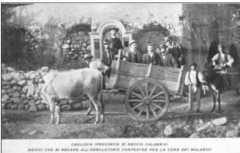
CAULONIA (PROVINCIA DI REGGIO CALABRIA) MEDICI CHE SI RECANO ALL'AMBULATORIO CARPESTRE PER LA CURA DEI MALARICI

Image: doctors in wagon Text: Doctors who go to the rural clinic for the treatment of malaria Notes: Price: E