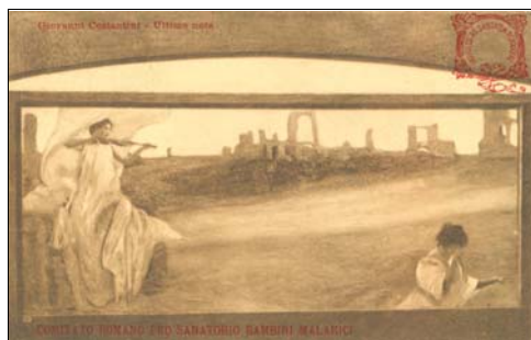
Image: fleeing a town in ruins Text: The Last Note by Giovanni Costantini Notes: cancelled Rome: January 13, 1912 Price: E