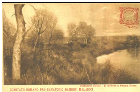
Image: stream Text: The Tiber at Prima Porta by Filiberto Petiti Notes: Price: E