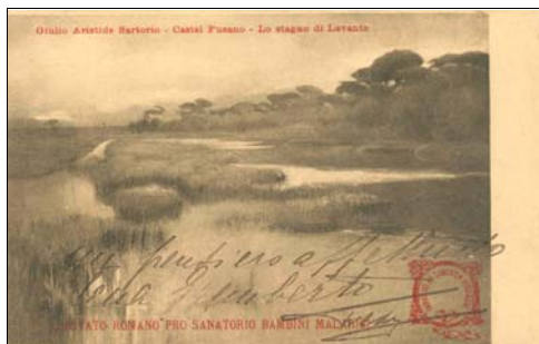
Image: swamp Text: Fusano Castle: The Levante Pond by Giulio Aristede Sartorio Notes: Price: E