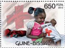
malaria endemic regions

Size: 42 x 30 mm Notes: singles from collective sheet Price: B