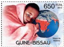
malaria endemic regions