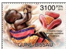
infant and blood cells

Size: 42 x 30 mm Notes: single from souvenir sheet Price: C