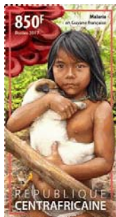
child, puppy and blood cells