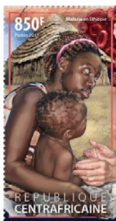
mother and child