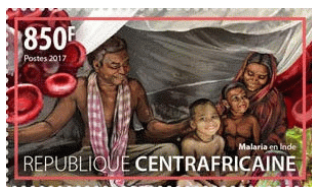
family with bed net

Size: 51 x 33mm; 33 x 51 mm Notes: singles from collective sheet Price: C