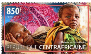
mother, child and plasmodium

Size: 51 x 33mm; 33 x 51 mm Notes: singles from collective sheet Price: C