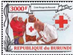
Red Cross workers