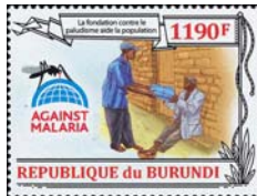
helping the people