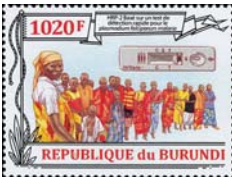
waiting for malaria test

Checklist: unused __ used __ fdc __ other __